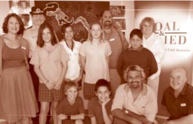
Students and community partners at the official unveiling of the 'ON TRACK' artwork at the Muswellbrook Regional Gallery

With funding support provided by the ADCC in November 2006, the 'ON TRACK' programme provides alternative education pathways for Indigenous young people who had dropped out or were at risk of dropping out of school. The Upper Hunter Valley based programme stemmed from collaboration between the Police, Aboriginal organisations and range of government and non government agencies in the Muswellbrook community.